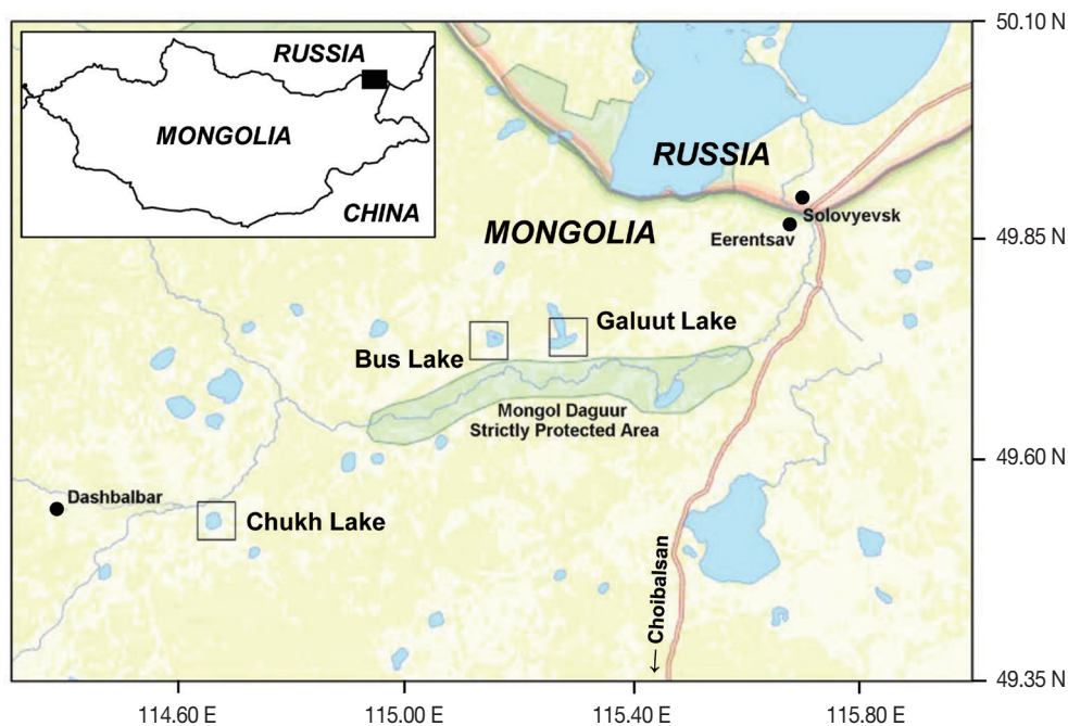
Fig. 1. Location of study sites in northeastern Mongolia where wild swan geese were sampled for parasitic lice in 2014.

From 27 to 31 July in 2014, we captured 14 swan geese at 3 lakes in northeastern Mongolia (Fig. 1) using standard dip-netting and corral trap techniques during the molting period [8,15]. We applied 70% ethyl alcohol to wet neck feathers for disease surveillance through blood sampling [15], and briefly searched head, neck, and breast of geese for lice running out of the plumage of the alcohol-applied and restrained geese.